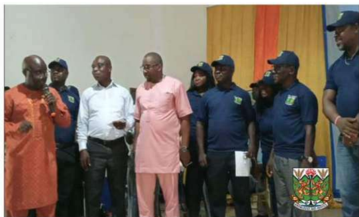
VC&P opens INSLACS celebration after addressing staff and students on four complementary values for growth and development