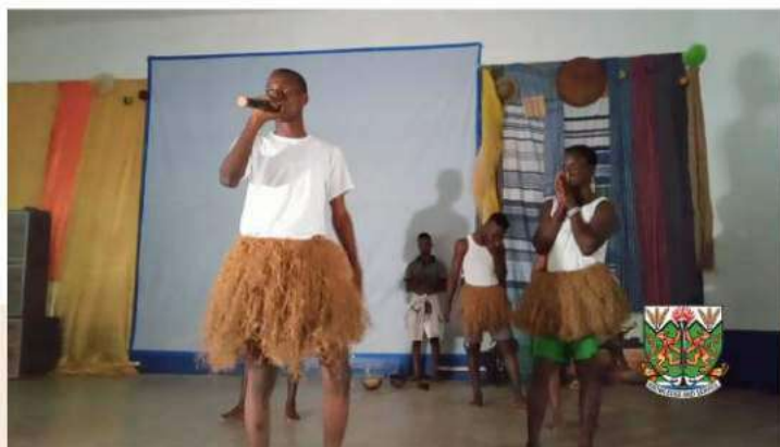
Students showcase culture and tradition through drama

The Institute of Languages and Cultural Studies (INSLACS) concluded a four-day celebration called INSLACS Week on Thursday 27 April 2023 at the Great Hall of the Towama Location, Bo Campus, with the theme, "A Unified Sierra Leone".